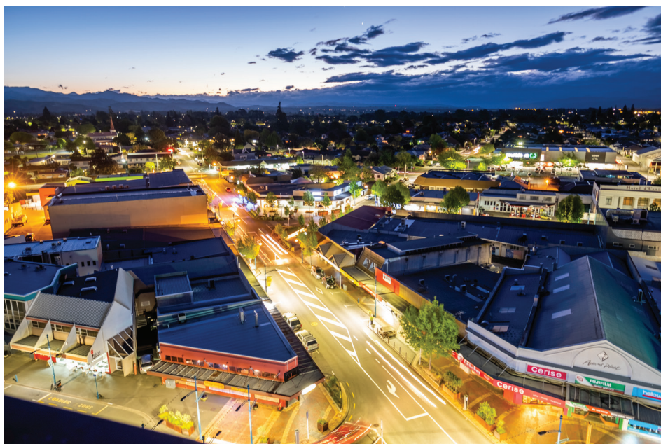
Looking west over the Blenheim CBD from the rooftop of Rangitāne House.