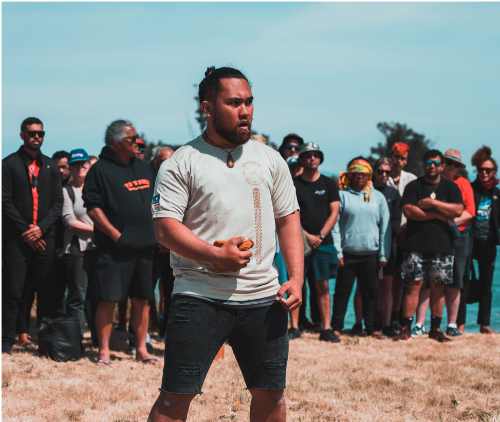
A special visit to Te Pokohiwi-o-Kupe for our Tahitian whanaunga.