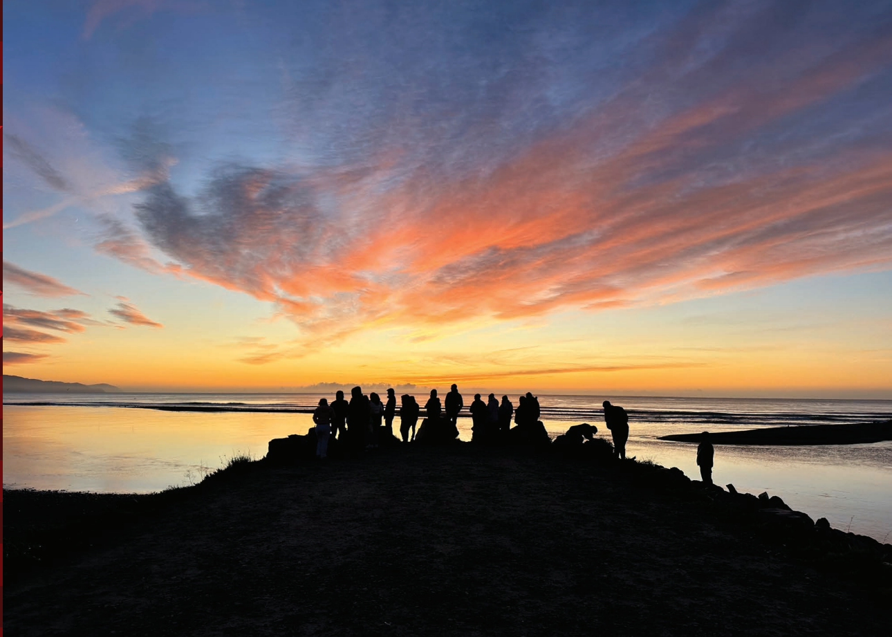
Sunrise at Wairau Bar - Matariki 2023.